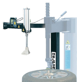
SX1 / Bead Press