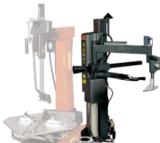
SUPERRM / Helper Arm