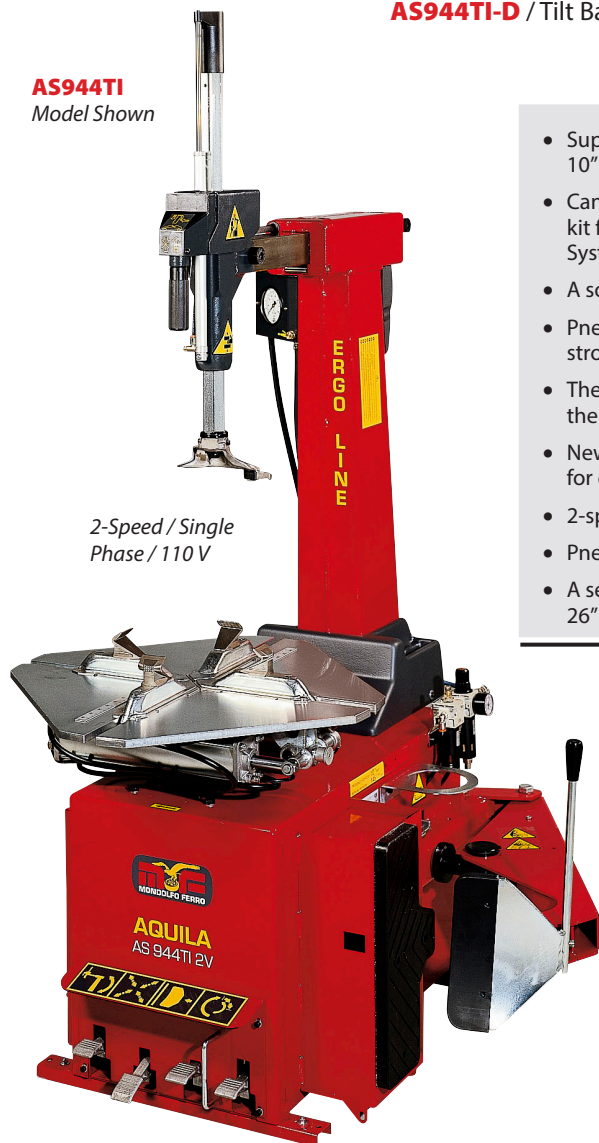
AS944TI Model Shown

AS944TI-D / Tilt Back Tire Changer With SUPERRM Helper Arm and Lift